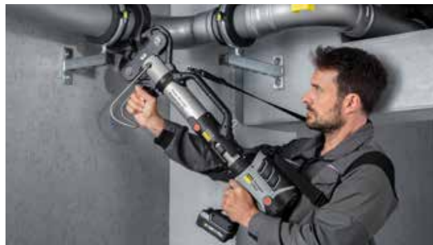
Enables pressing of thick-walled steel up to 4 inch: the Pressgun Press Booster.