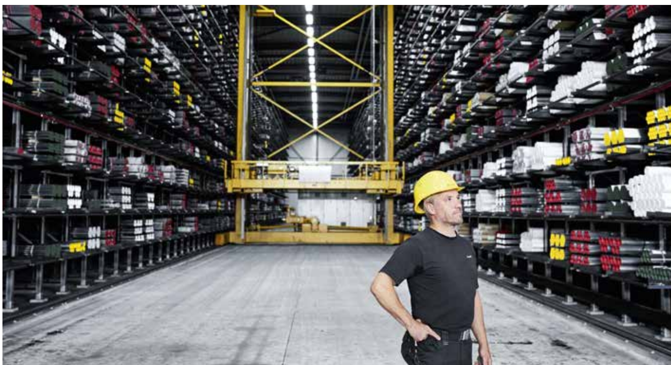
More than 17,000 product range items and spare parts are always in stock and thus available to Viega customers at any time.