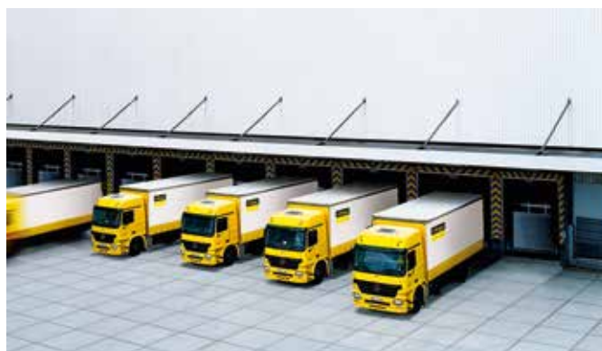
The company-owned logistics stands for on-time deliveries.